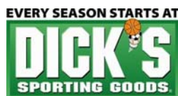
Dick's Sporting Goods