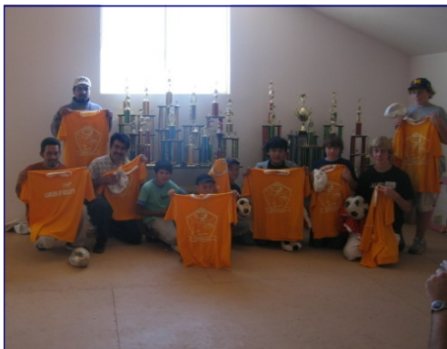
A team in Mexico proudly displays their RYSA gear!

Ever wonder what happens to all RYSA's leftover shirts and old, worn soccer balls? At RYSA, we work with a number of people in our area to pass those items along to youth in other parts of the world who are in need of them.