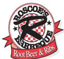
Roscoe's Root Beer & Ribs